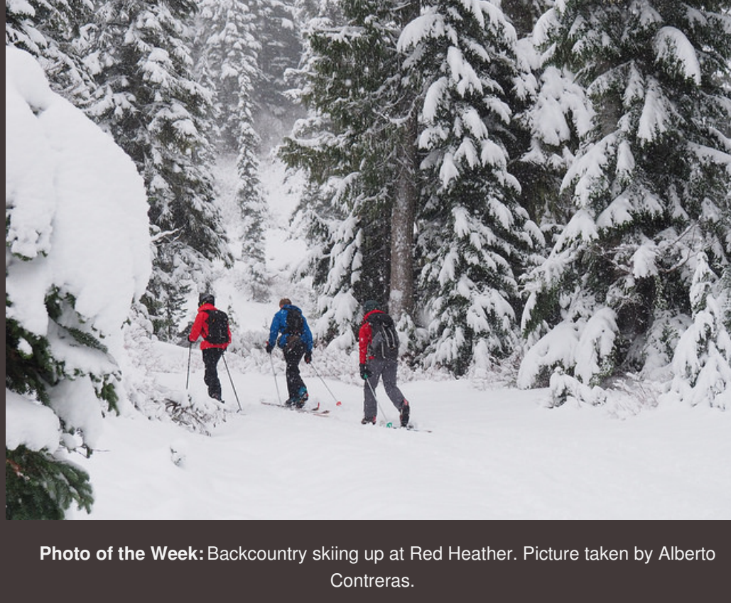
Photo of the Week: Backcountry skiing up at Red Heather.