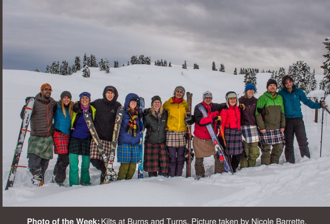
Photo of the Week: Kilts at Burns and Turns.