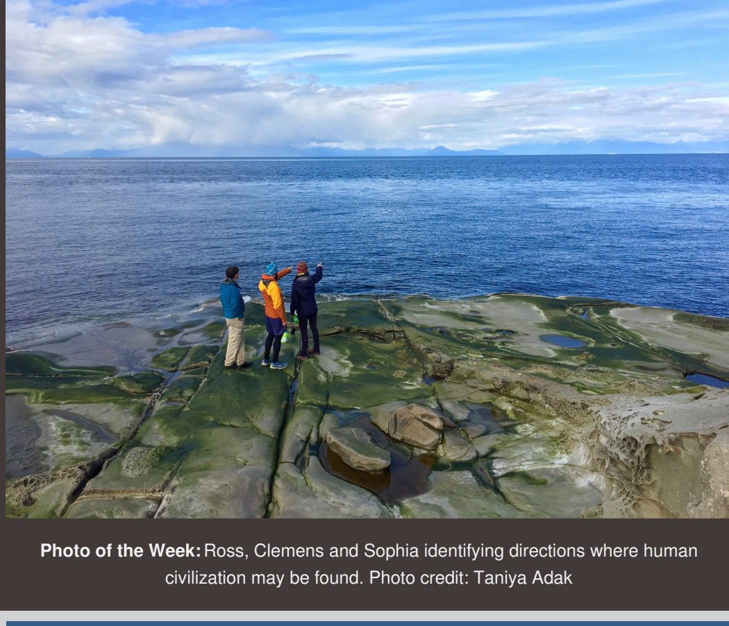
Photo of the Week: Ross, Clemens and Sophia identifying directions where human civilization may be found.