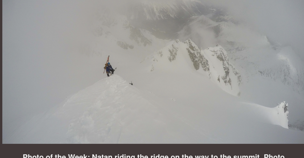
Photo of the Week: Natan riding the ridge on the way to the summit.