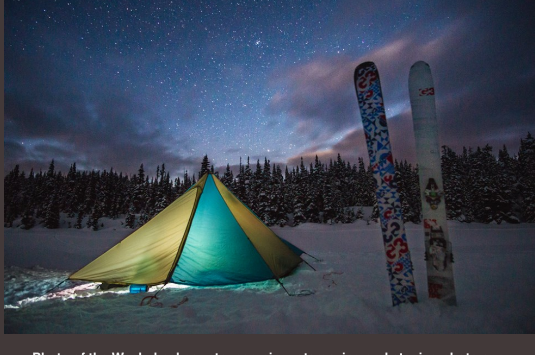
Photo of the Week: backcountry camping: stargazing and staging photo ops.